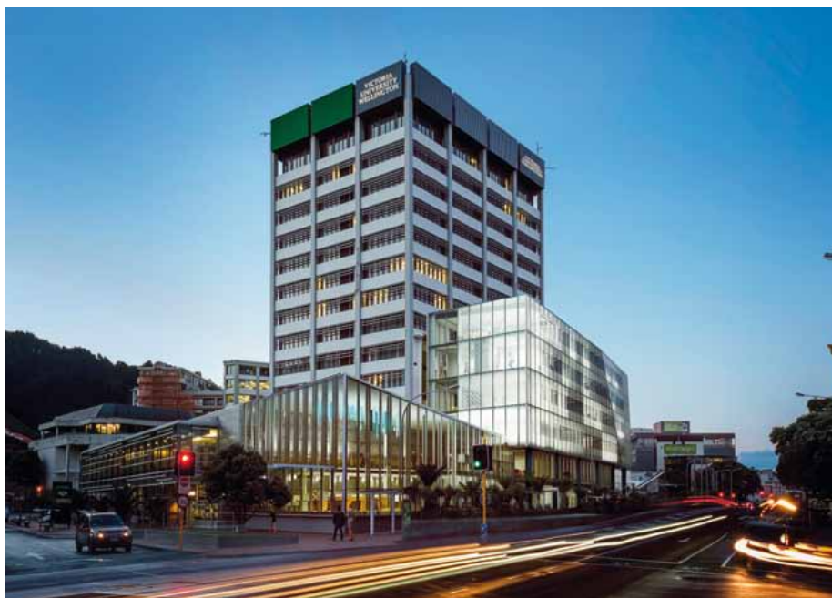
Victoria Business School.

*Study in Trimester 3 is only available for specific programmes.