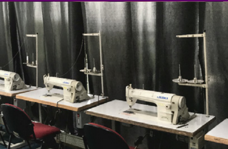
FASHION DESIGN LAB