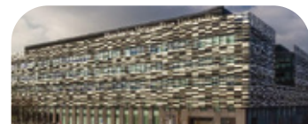
Manchester Metropolitan University, UK