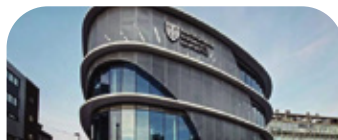
Northumbria University, UK