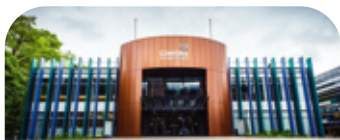
Coventry University, UK or Singapore