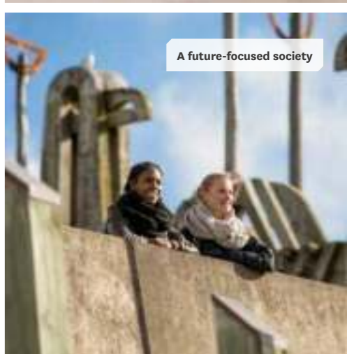
A future-focused society