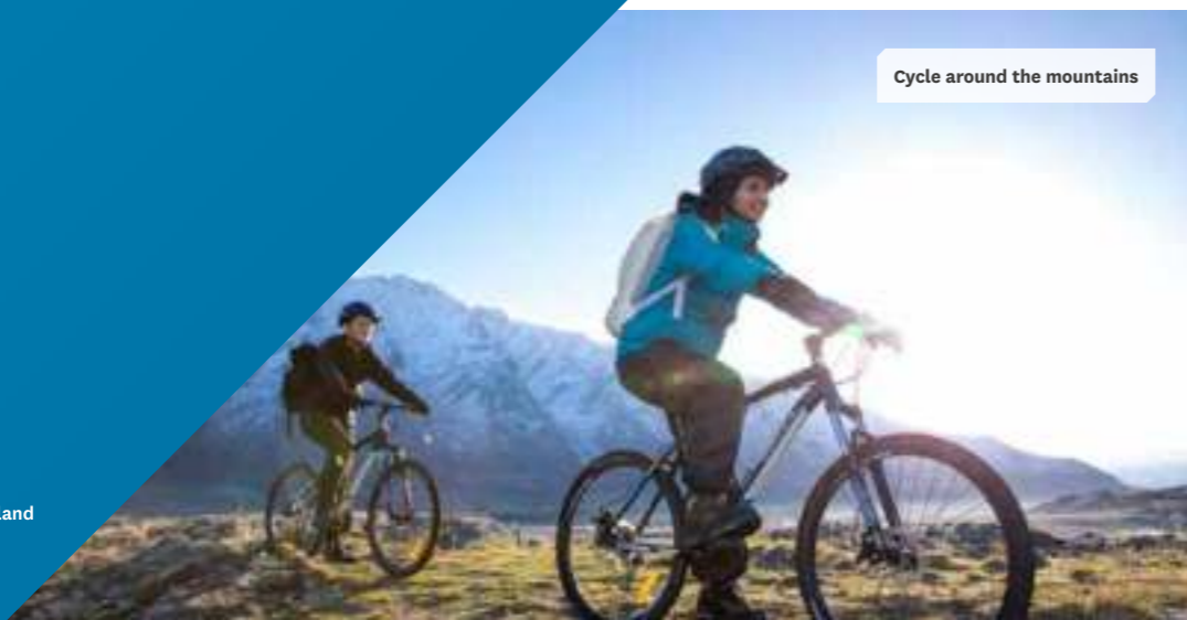
Cycle around the mountains