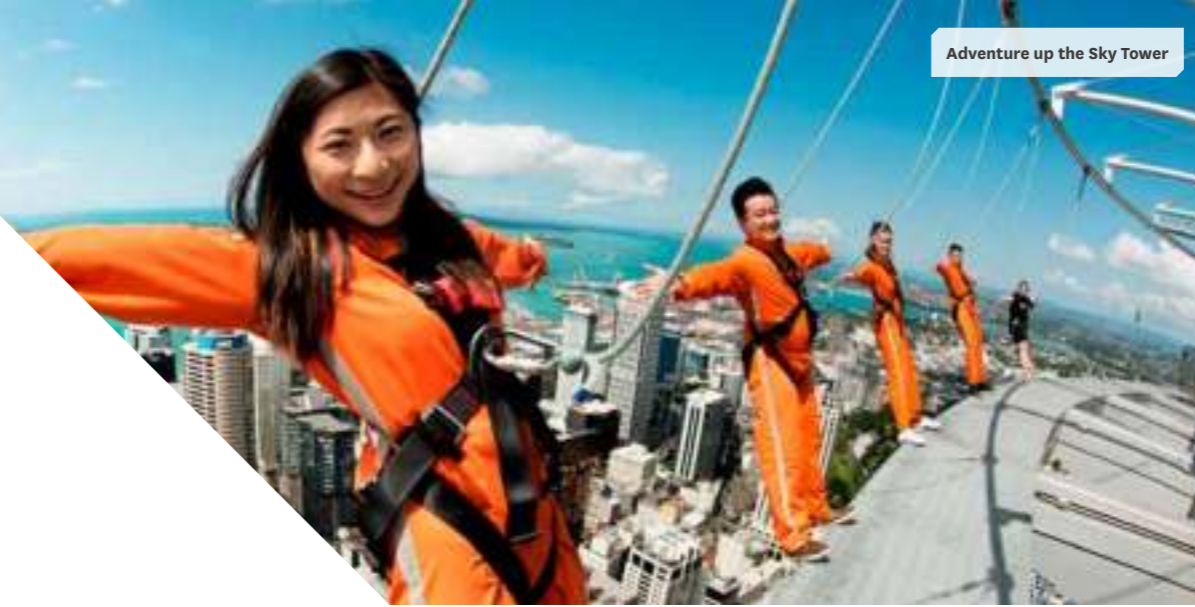
Adventure up the Sky Tower