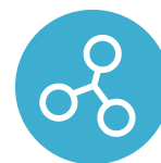
Arts, Social Science & International Studies

Excellent UNSW Foundation Studies in Indonesia