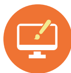
Design, Fine Arts & Media Building