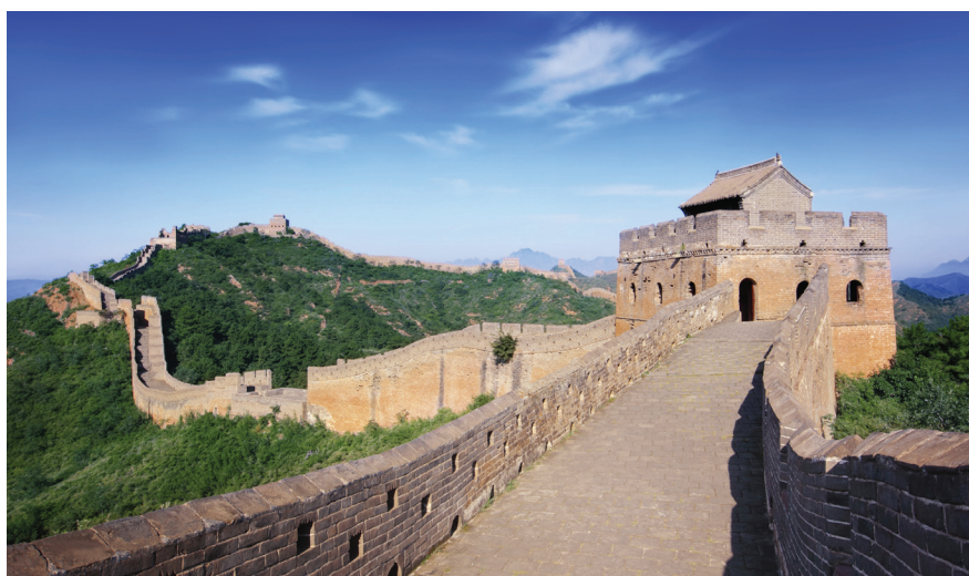
The Great Wall of China

Expression of interest closes on Sunday 15 November 2015.