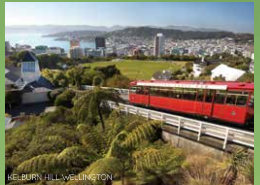
KELBURN HILL WELLINGTON