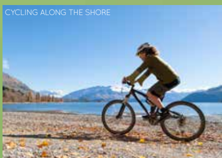
CYCLING ALONG THE SHORE