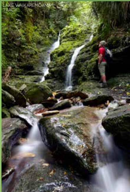
LAKE WAIKAREMOANA TRACK