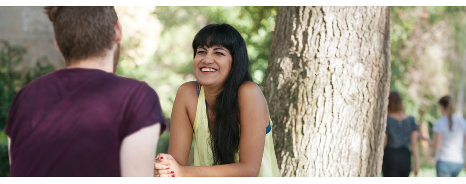
RTO CODE: 52787