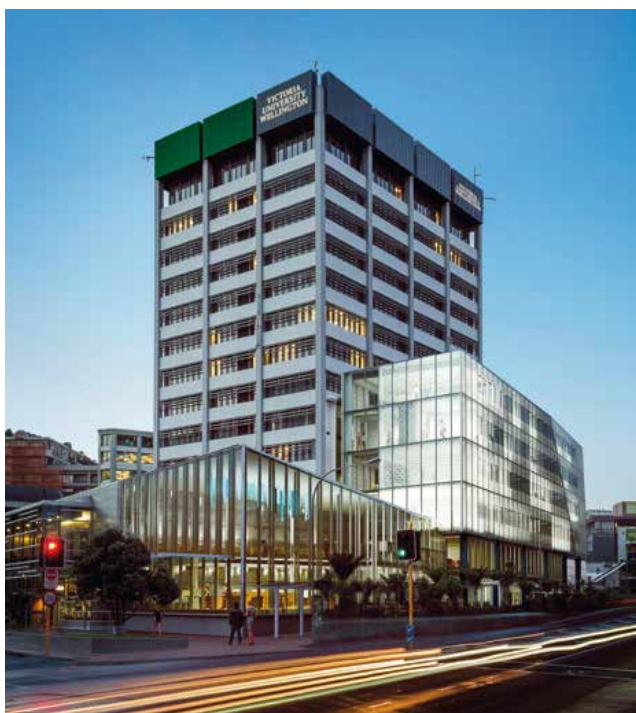
Victoria Business School.

First-year courses usually have up to three 50-minute lectures per week. There may also be one tutorial or laboratory/studio session per week. In tutorials, smaller groups of students meet with a tutor to discuss work covered in lectures. A laboratory or studio is a longer, hands-on class, where students may work more actively together. For most courses, work is assessed by a combination of essays, in-class tests and exams.