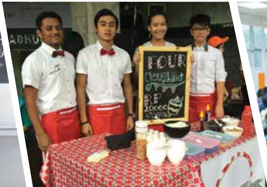
Business Plan Exhibition