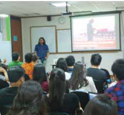
Guest Lecturer (Air Asia)