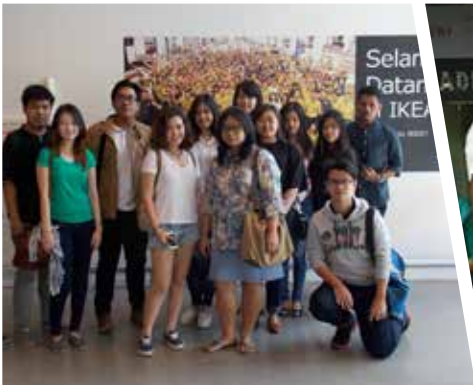
Company Visit (IKEA)